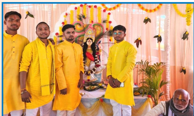
Saraswati Puja (Feb. 2, 2025)