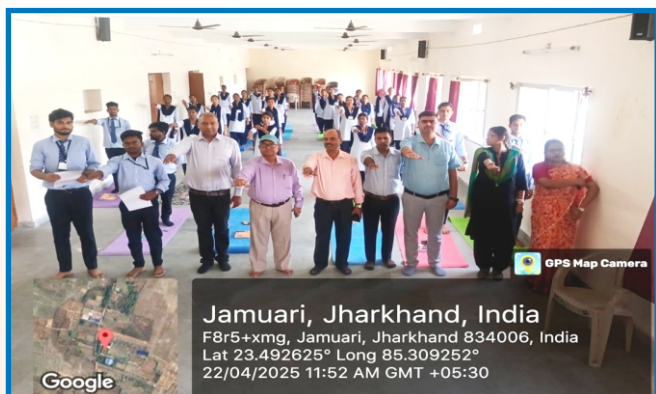
World Earth Day (April 22, 2025)