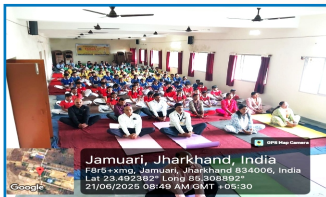
International Yoga Day (June 21, 2025)