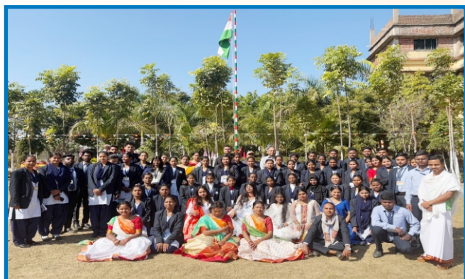
Republic Day (Jan 26, 2025)